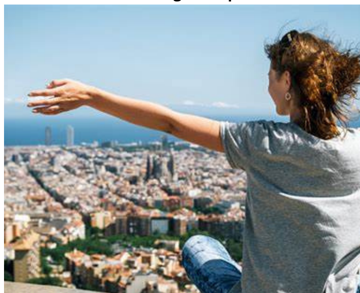
View of BARCELONA